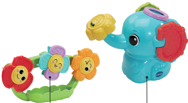
3 Spinning Flowers

Get ready for trunkful's of fun with the Spin & Splash Bathtime Flowers! Use the cute elephant watering can to pour water over the textured flowers and watch them spin! Twist the spout to change the water spray pattern for fun visual effects. Bathtime has never been so fun!